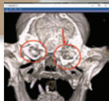
Above is a 3D image of a case from Dr. Munir Kureshi which shows one bulla much enlarged as compared to the other. The image also shows communication with the brain.